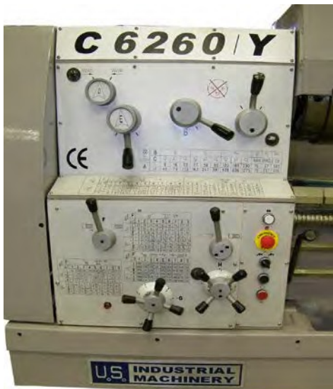
Detail of Headstock