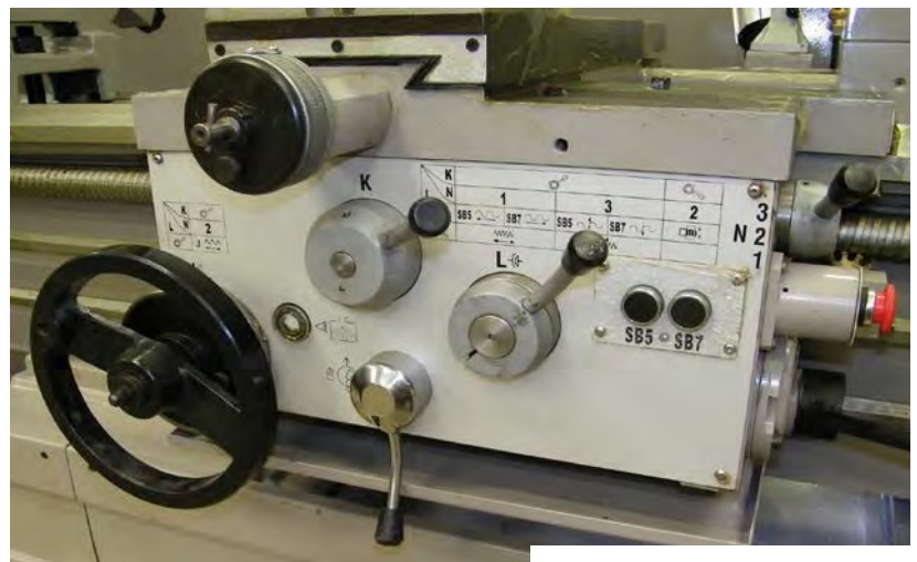
Detail of Apron Cross feed handle removed for shipping.