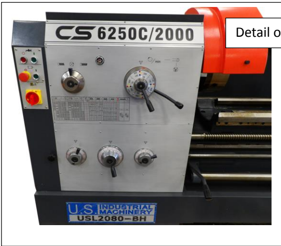
Detail of Headstock

Visit Our Web Site at www.usindustrial.com