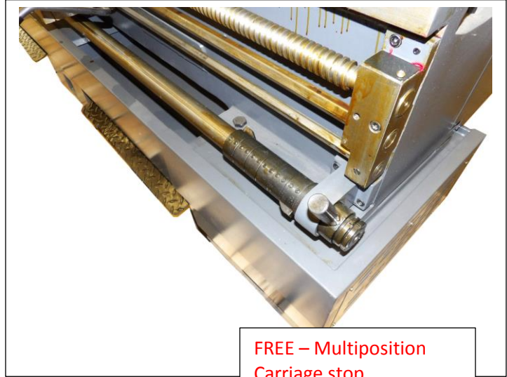
FREE – Multiposition Carriage stop