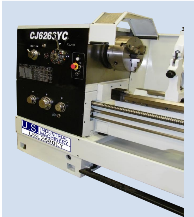
Detail of Headstock, chuck and guard