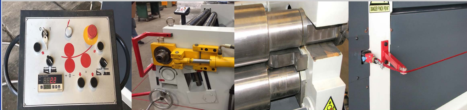
Emergency Stop Safety Trip-Wire

Equipment for the American Industry 120 Webster Ave. Memphis, TN 38126 800-860-1850 Fax:901-526-2339