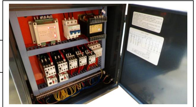
Detail showing control panel with reciprocation and electric motor table crossfeed control selection. Also with motorized wheelhead elevation.