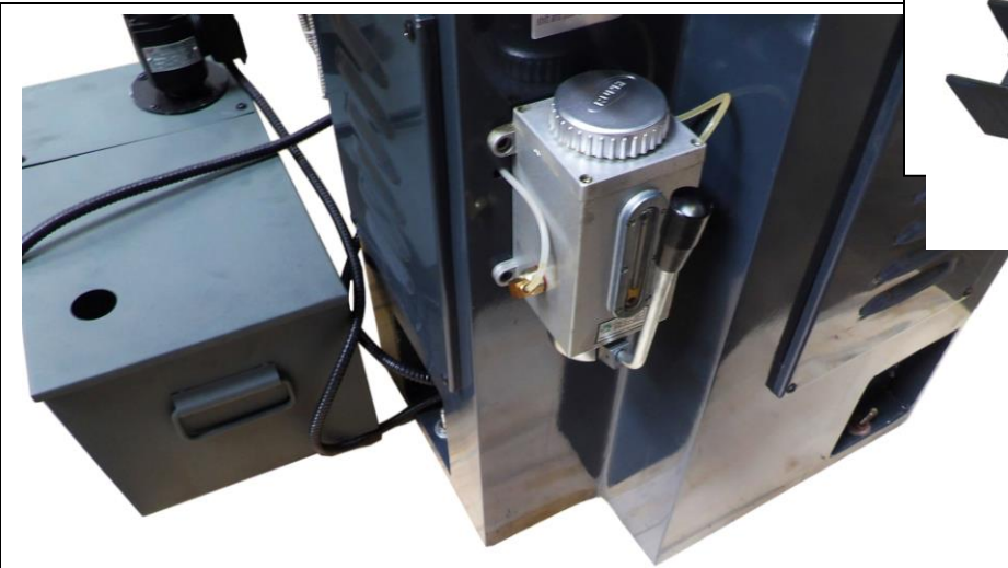
Detail of manual one-shot lube, and flood coolant tank.

Thank you for the opportunity to quote. We look forward to serving you.