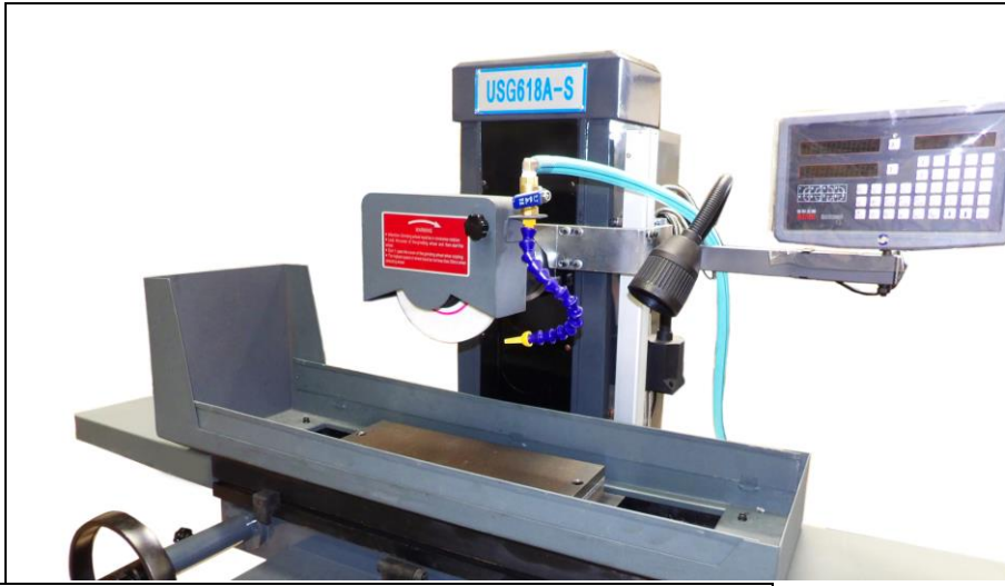
Detail showing permanent magnetic chuck, 2-axis digital readout display, flood coolant nozzle, worklight.