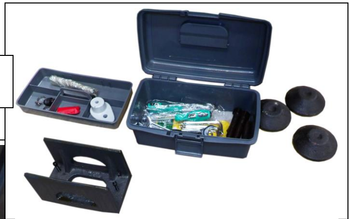
Toolbox with wheel balancing stand, Table dresser with diamond, foot pads.