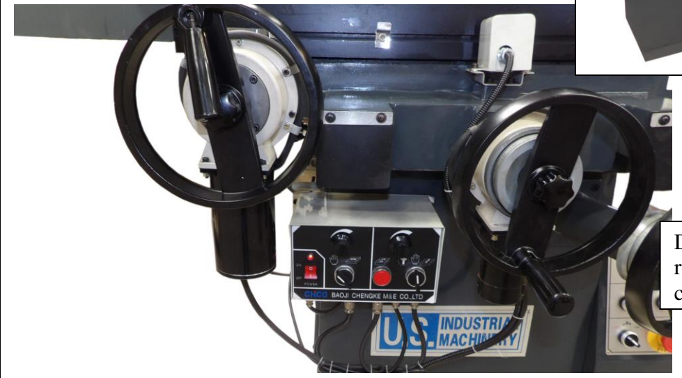
Detail showing electric motor table reciprocation and electric motor table crossfeed control selection.

Thank you for the opportunity to quote. We look forward to serving you.