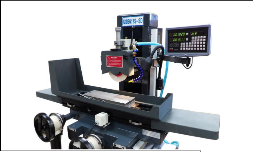
Detail showing permanent magnetic chuck, over wheel diamond dresser, 2-axis digital readout display, flood coolant nozzle