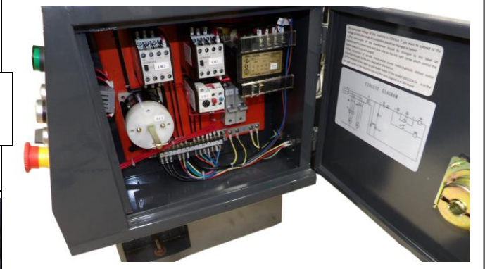
Detail showing electrical cabinet, with disconnect and fuse holders.