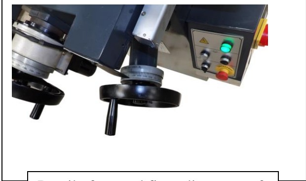
Detail of manual fine adjustment of downfeed with 0.0002" graduations