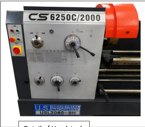
Detail of Headstock

Visit Our Web Site at www.usindustrial.com