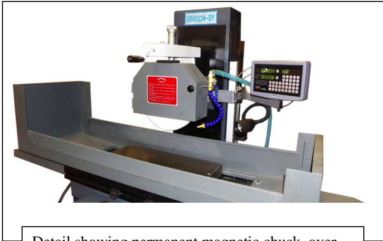
Detail showing permanent magnetic chuck, over wheel diamond dresser, 2-axis digital readout display, flood coolant nozzle