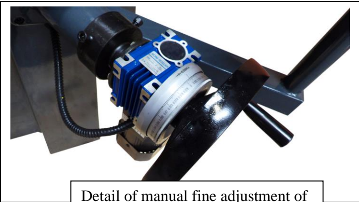
Detail of manual fine adjustment of downfeed with 0.0004" graduations. Wheelhead Elevation Motor shown.