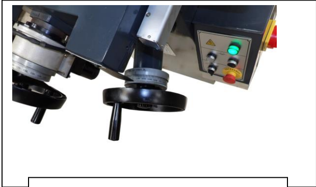
Detail of manual fine adjustment of downfeed with 0.0002" graduations