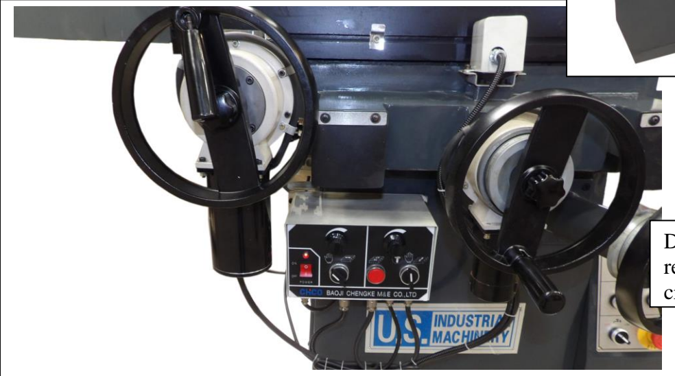
Detail showing electric motor table reciprocation and electric motor table crossfeed control selection.

Thank you for the opportunity to quote. We look forward to serving you.