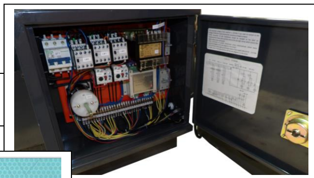
Detail showing electrical cabinet, with disconnect and fuse holders.