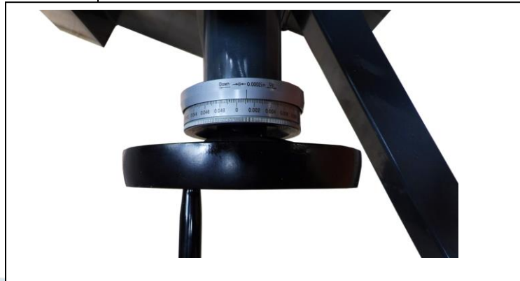
Detail of manual fine adjustment of downfeed with 0.0002" graduations