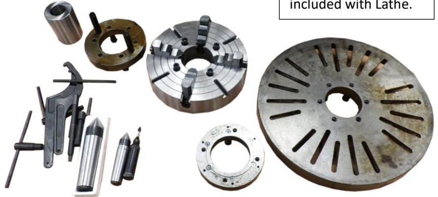
Also includes steady rest, follow rest, 3-jaw chuck, and 2-axis DRO See pic on Page 1.