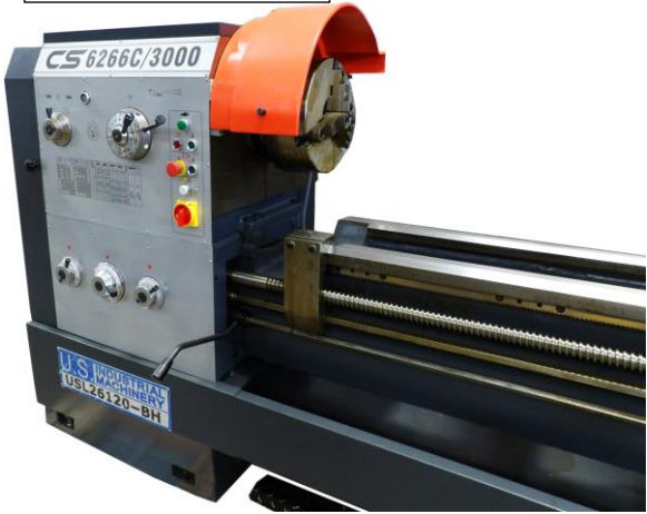
Detail of Headstock