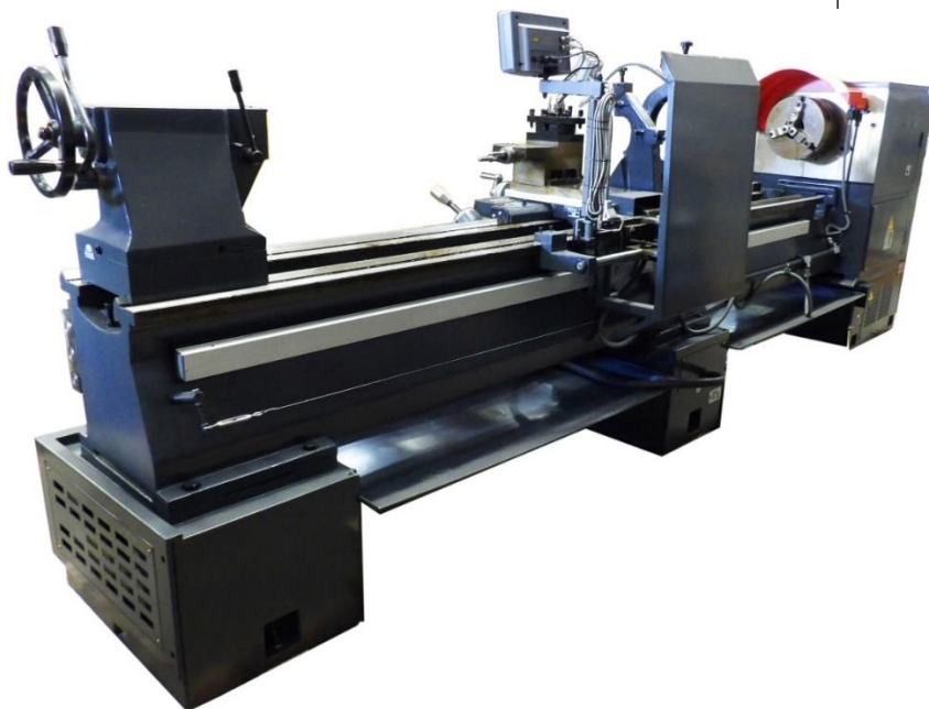
View from back of lathe shows travelling backslash.