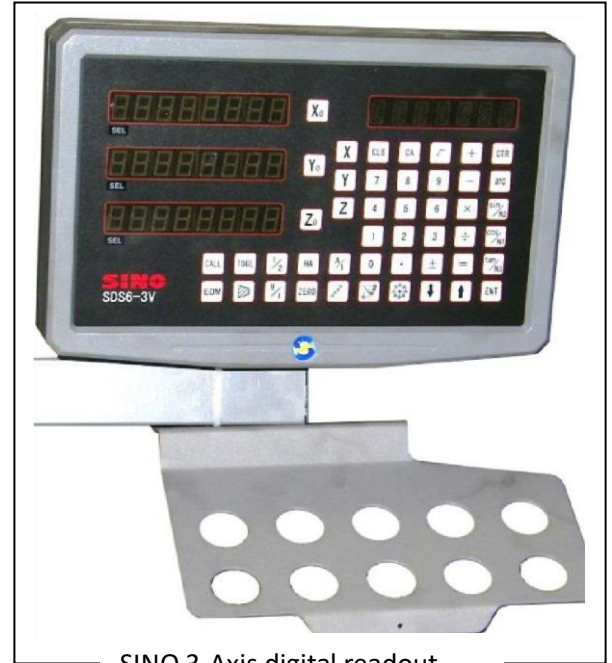
SINO 3-Axis digital readout measure table, cross and knee travel, inch/metric, and multi-functionality