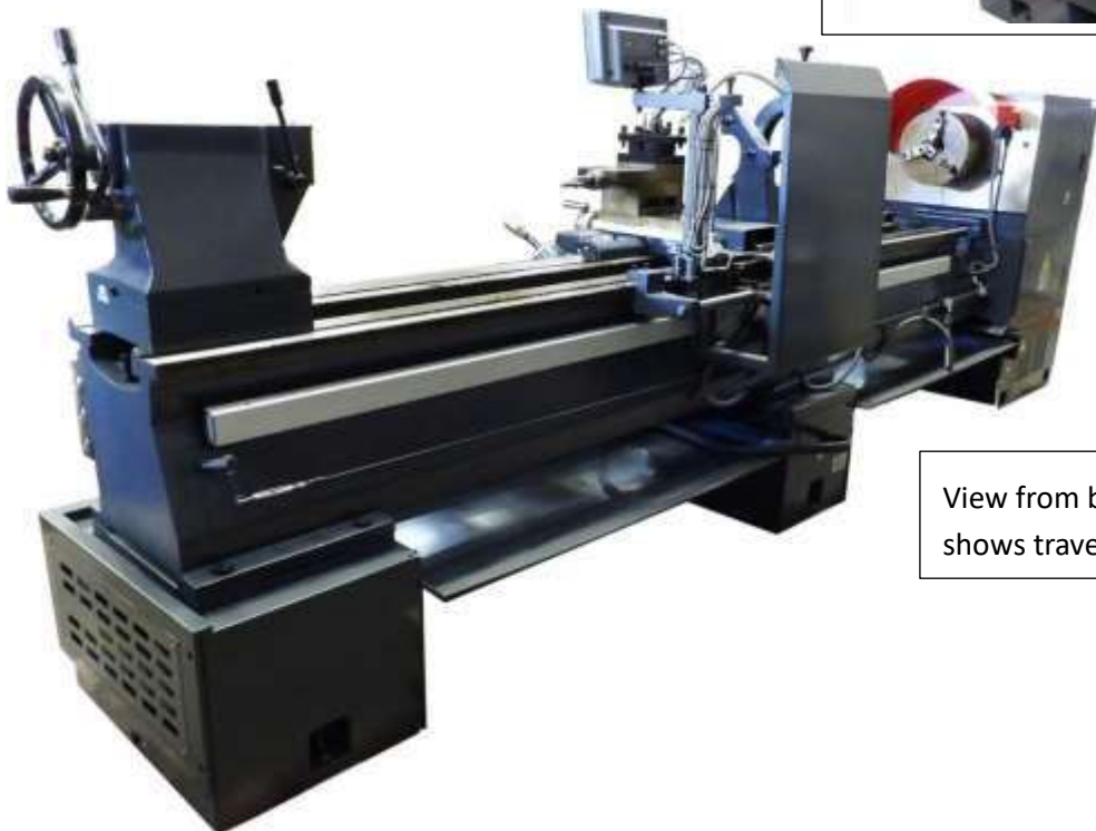
View from back of lathe shows travelling backslash.