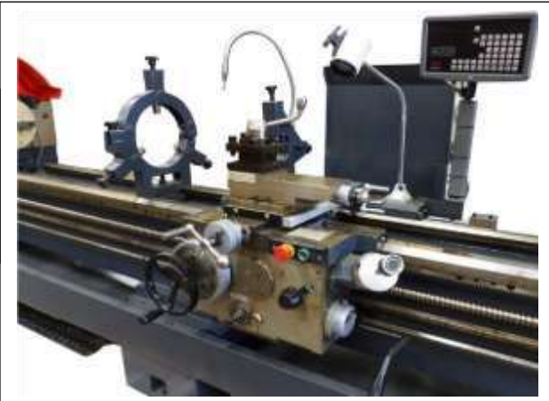
Apron with travelling digital readout display, follow rest, steady rest, taper attachment, rapid travels.

Also includes steady rest, follow rest, 3-jaw chuck, and 2-axis DRO See pic on Page 1.