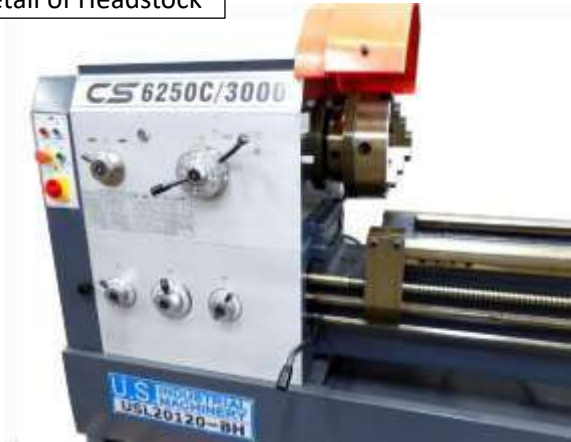
Detail of Headstock