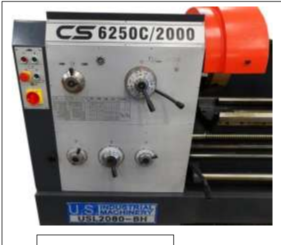
Detail of Headstock

P.O. BOX 2098 MEMPHIS, TN 38101 PHONE: (800) 860-1850 FAX: (901) 526-2339 Visit Our Web Site at www.usindustrial.com