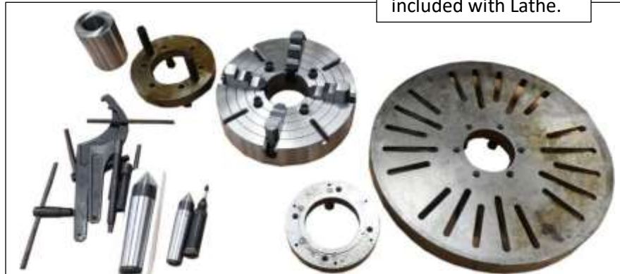
Standard Accessories included with Lathe.