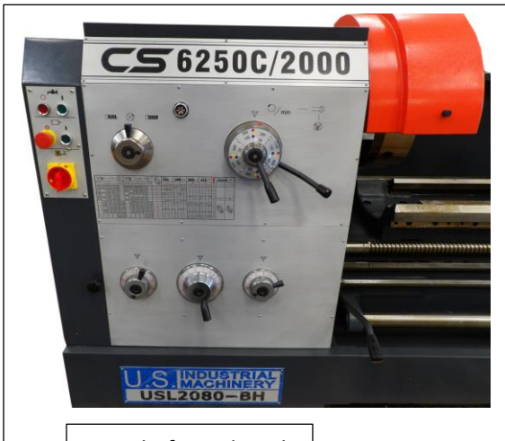
Detail of Headstock

Visit Our Web Site at www.usindustrial.com