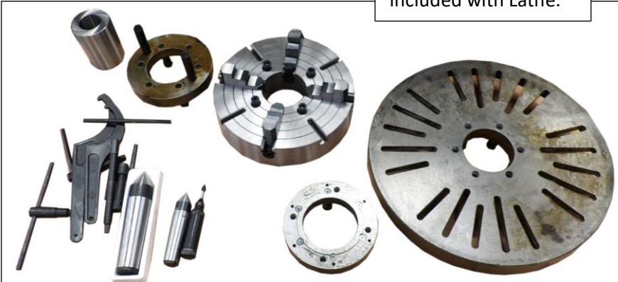
Standard Accessories included with Lathe.

Also includes steady rest, follow rest, 3-jaw chuck, and 2-axis DRO See pic on Page 1.