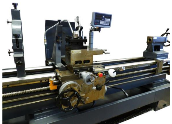
Apron with travelling digital readout display, follow rest, steady rest, taper attachment, rapid travels.